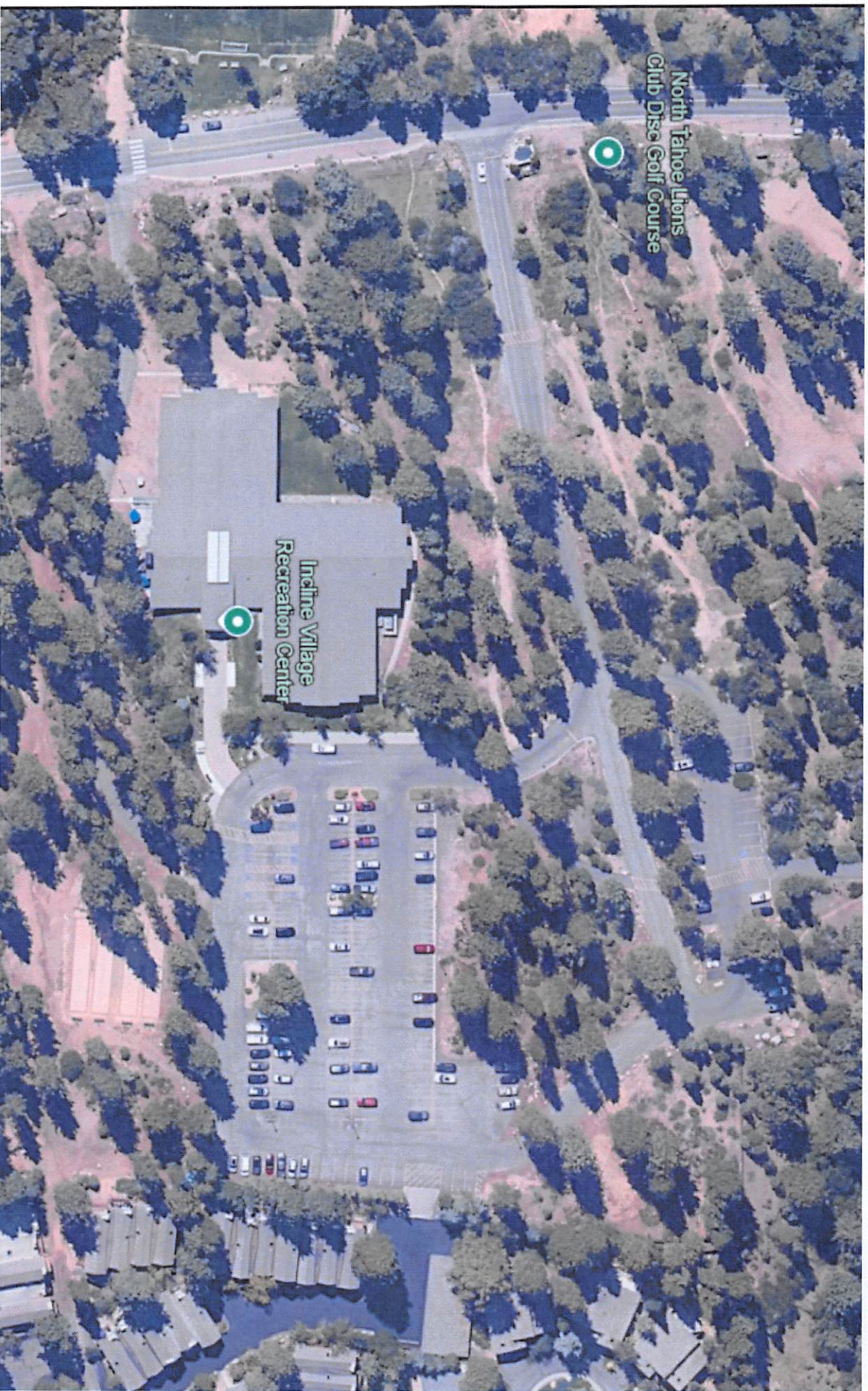
Figure 5 - Recreation & Tennis Center Parking