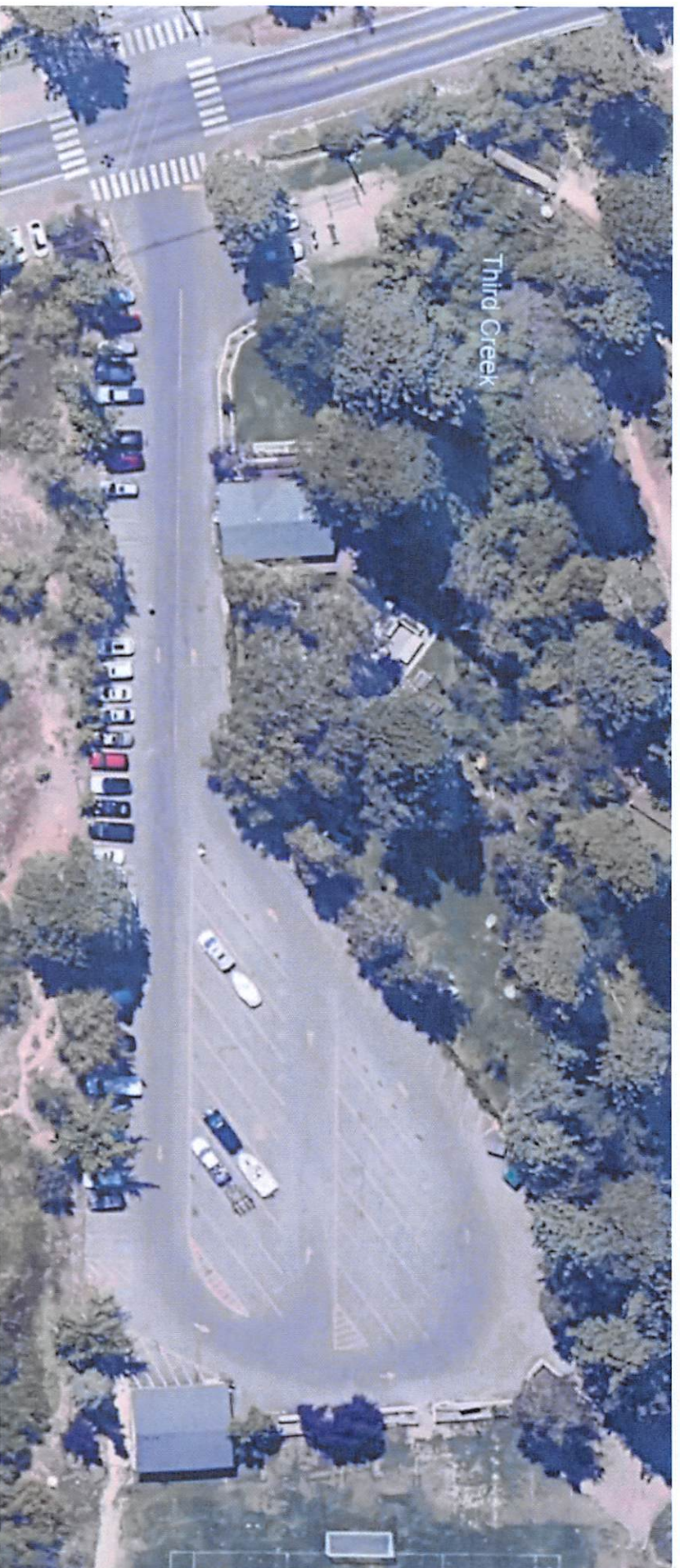
Figure 3 - Village Green & Aspen Grove Parking Lots