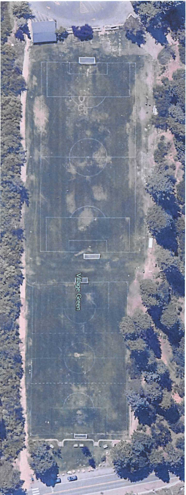
Figure 2 - Village Green