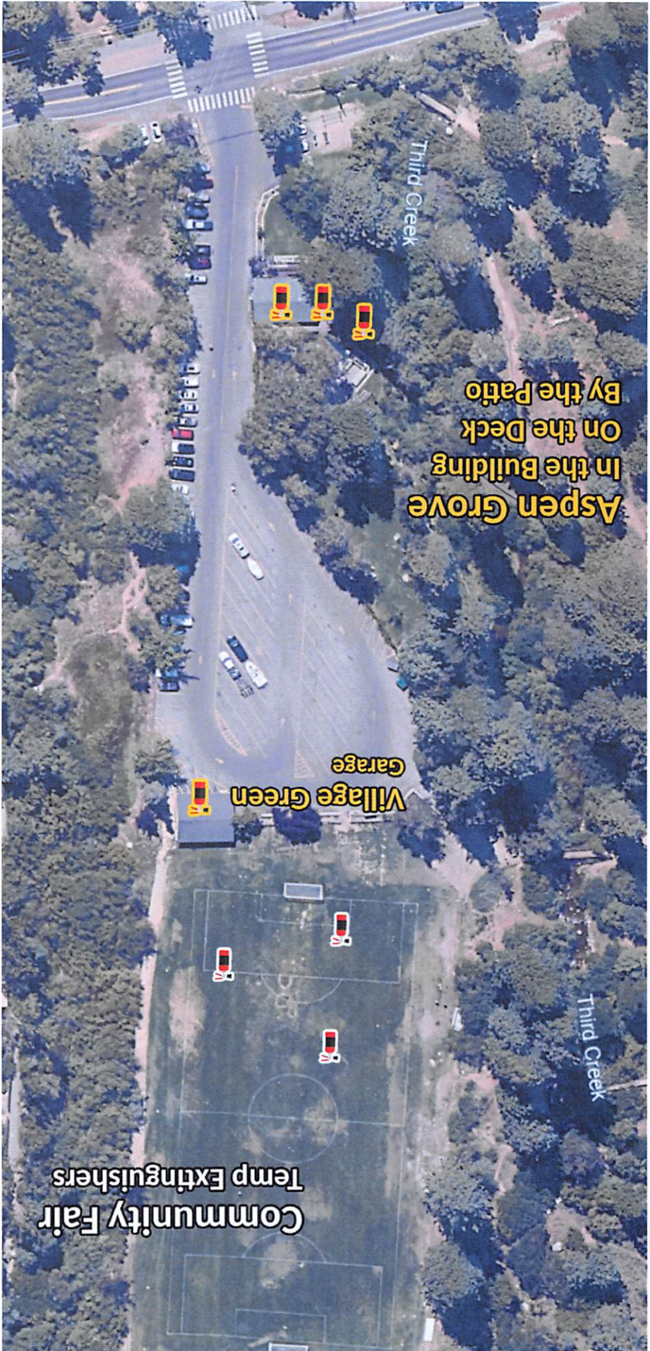
Figure 6 - Village Green & Aspen Grove Temporary Fire Extinguishers