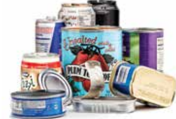
Food & Beverage Cans Tin, aluminum, steel food & beverage cans