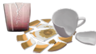
Broken Glass & Ceramics