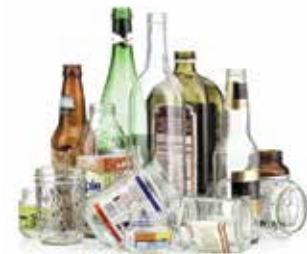
Glass Bottles, jars