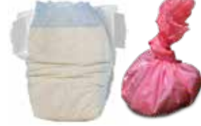
Diapers & Pet Waste