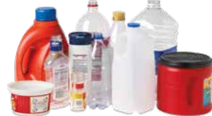
Plastic Bottles & Containers Bottles, jars, jugs & tubs