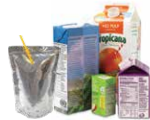
Juice Pouches/Boxes, Cartons (with plastic tops)

Do not place Household Hazardous Waste or electronic waste in the trash cart. For proper handling, please see the Household Hazardous Waste panel.