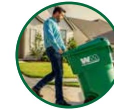
Set out carts at the curb on collection day by 7 a.m.