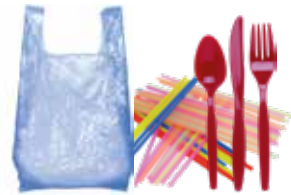
Plastic Bags, Straws & Utensils