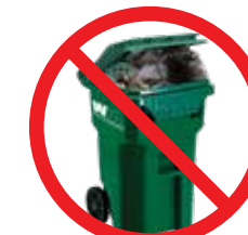
Do Not Overfill