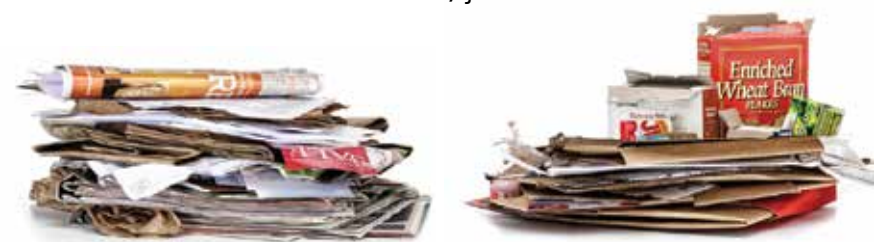
Paper, Flattened Cardboard & Paperboard Flatten all boxes (do not bundle/tie up) No shredded paper.