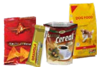
Food Wrappers, Pet food Bags