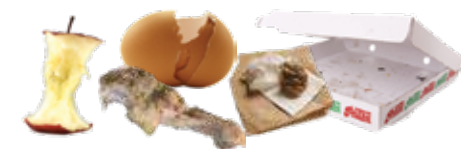
Food Waste & Food Soiled Paper