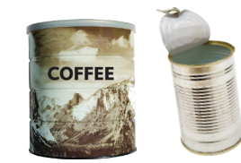
Empty Aluminum, Tin & Steel Cans