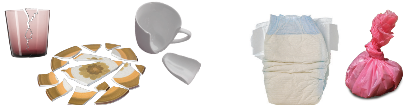
Broken Glass & Ceramics