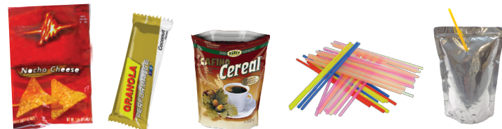
Food Wrappers, Straws, & Juice Pouches

Do not place Household Hazardous Waste or electronic waste in the trash cart. For proper handling, please see the Household Hazardous Waste panel.