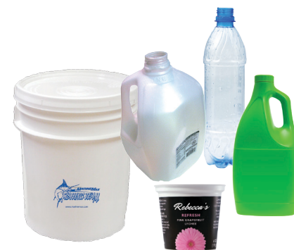
Empty Plastic Bottles & Containers

Do not place trash, Household Hazardous Waste or electronic waste in the recycling cart. For proper handling, please see the Household Hazardous Waste panel.